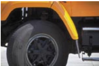
Here you can write something about the figure above. Lorem ipsum dolor conseteaus elita sed diamnuone et ae voulupta.

The systems have been constructed on the basis of the idea of collecting and storing Runway data, road data or bridge data in one place and at the same time organising the data, so that an optimum possibility of data retrieval and import is obtained. Furthermore, the data may form the basis of calculation of advanced short - and long-term maintenance strategies.