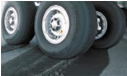
Based on the calculated field data, PCN values (Pavement Classification Number) are determined for individual pavement sections.

Like RoSy DESIGN for roads, the software for airport can work fully integrated with RoSy BASE.